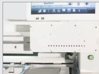
Color change box

The full screen makes it easy for the user to scan the outputs at one view and operate the machine more effectively and conveniently