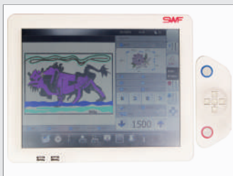
15.1 inch full touch operation panel

The full screen makes it easy for the user to scan the outputs at one view and operate the machine more effectively and conveniently